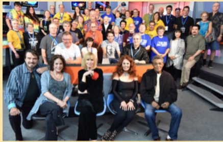
The Stars of Trekonderoga: Actors and writers of the original Star Trek series pose with the Trek volunteers.

TRA and Retro Film Studios are currently discussing how we can help them grow their operations to include year-round studio tours and a potential Star Trek museum that would be the only one of its kind in the country. This would provide a year-round tourism draw to Ticonderoga with a "suite" of Trek activities in the downtown area.