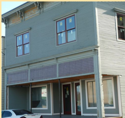
The first dormitory units will be located in the Huestis Building next to Sunshine Laundry with a bakery in the first floor storefront.

Under the agreement, Jasama LLC will create dormitory suites for 16 students in the upper level of what is known as the Huestis Building, next door