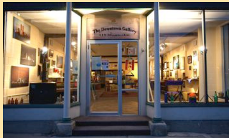
Our new home. We're sharing space with the Downtown Gallery