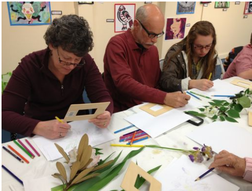
Artists explore the visual techniques of Georgia O'Keeffe in a workshop at the gallery led by the Hyde Museum.

Visual, performance, craft, and literary arts are finding a strong audience in our community.